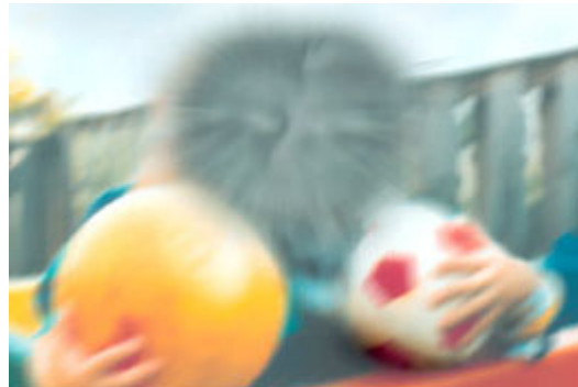
The same scene as viewed by a person with advanced age-related macular degeneration